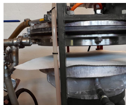
Tower press test unit simulates the operation of the full-size industrial filter.