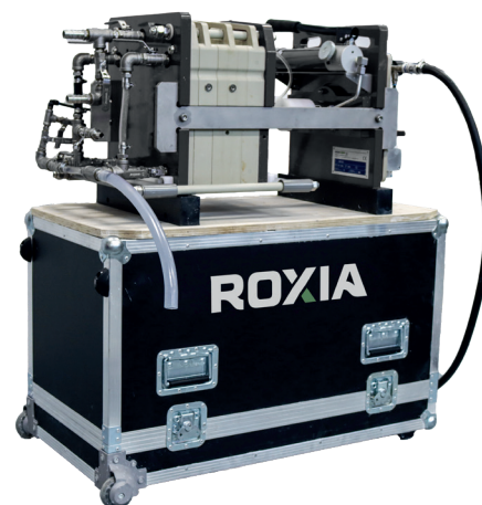
The small-scale test unit makes it easier & faster to test slurry on site, without disturbing the production.