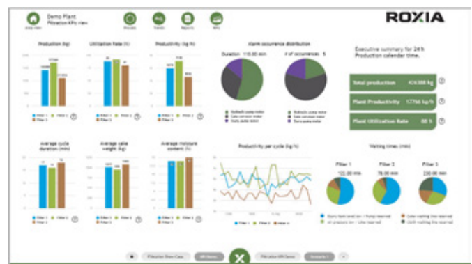
Roxia troubleshooting tools detect abnormalities in the process and automatically send alarms via email.