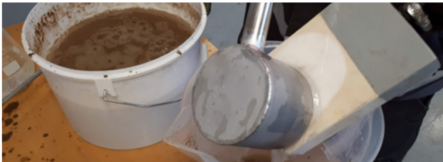
The ceramic disc test unit can also simulate the ultrasonic washing cycle just like the full-size industrial filter

Testing the slurry is essential before choosing the correct filter type and size. In this way, we can ensure the best possible process performance and most cost-efficient solution for each application. Filtration testing can be done on site or in Roxia filtration laboratory.