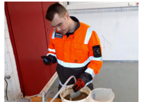
Simple ceramic dip test set fits in a smaller suitcase and requires little space.