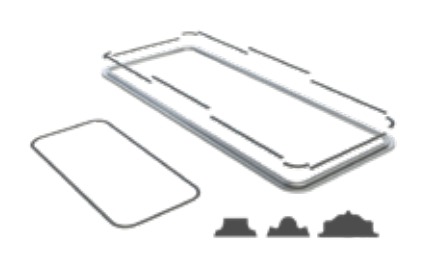
Plate seals Seal materials: NR and EPDM